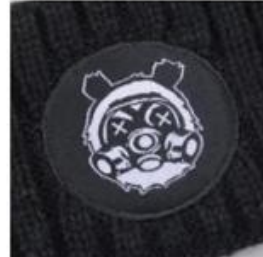
WOVEN LABEL & MERROWED EDGE HIGH DETAIL | RAISED MERROWED EDGING