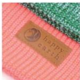
SUEDE/LEATHER FULLY STAMPED LEATHER OR SUEDE

Customize your beanie with your personal branding or artwork. Choose from any of these styles and get creative with your design.