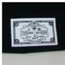
WOVEN LABEL HIGH LEVEL OF DETAIL | SEWN DIRECTLY TO FABRIC