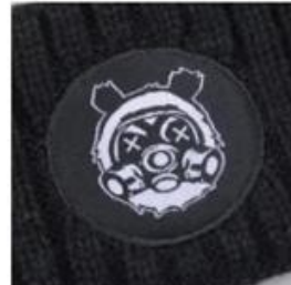
WOVEN LABEL & MERROWED EDGE HIGH DETAIL | RAISED MERROWED EDGING