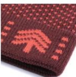
JACQUARD KNIT WOVEN TEXT OR GRAPHICS | ALLOWS FOR CREATIVITY