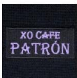
EMBROIDERED PATCH 100% EMBROIDERED PATCH | MERROWED EDGE