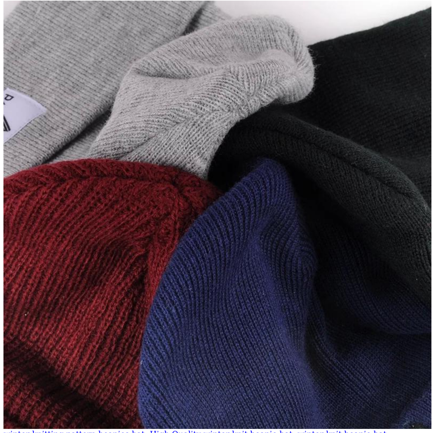
winter knitting pattern beanies hat, High Quality winter knit beanie hat, winter knit beanie hat other winter hats you may like: