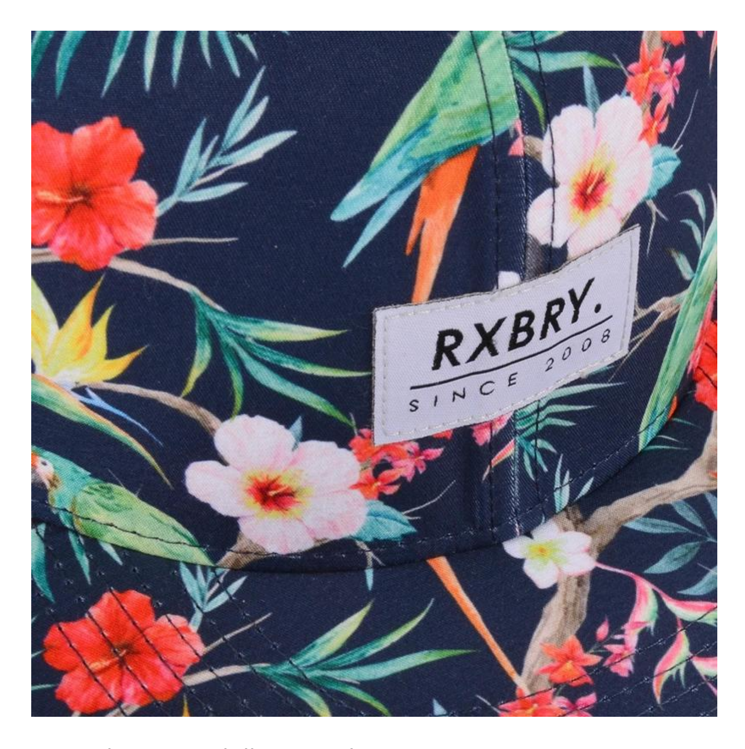
More pictures and discount, please CLICK HERE>>>