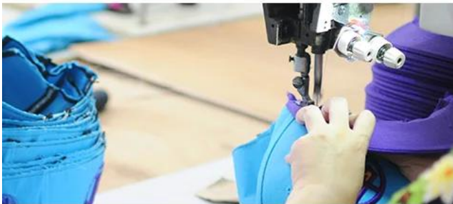
SEAMING & STITCH LINES