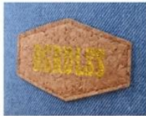
PRINT CORK PATCH