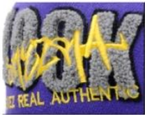
APPLIQUE WITH TOWEL