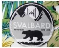
WOVEN KABEK PATCH/ PRINT LABEL PATCH