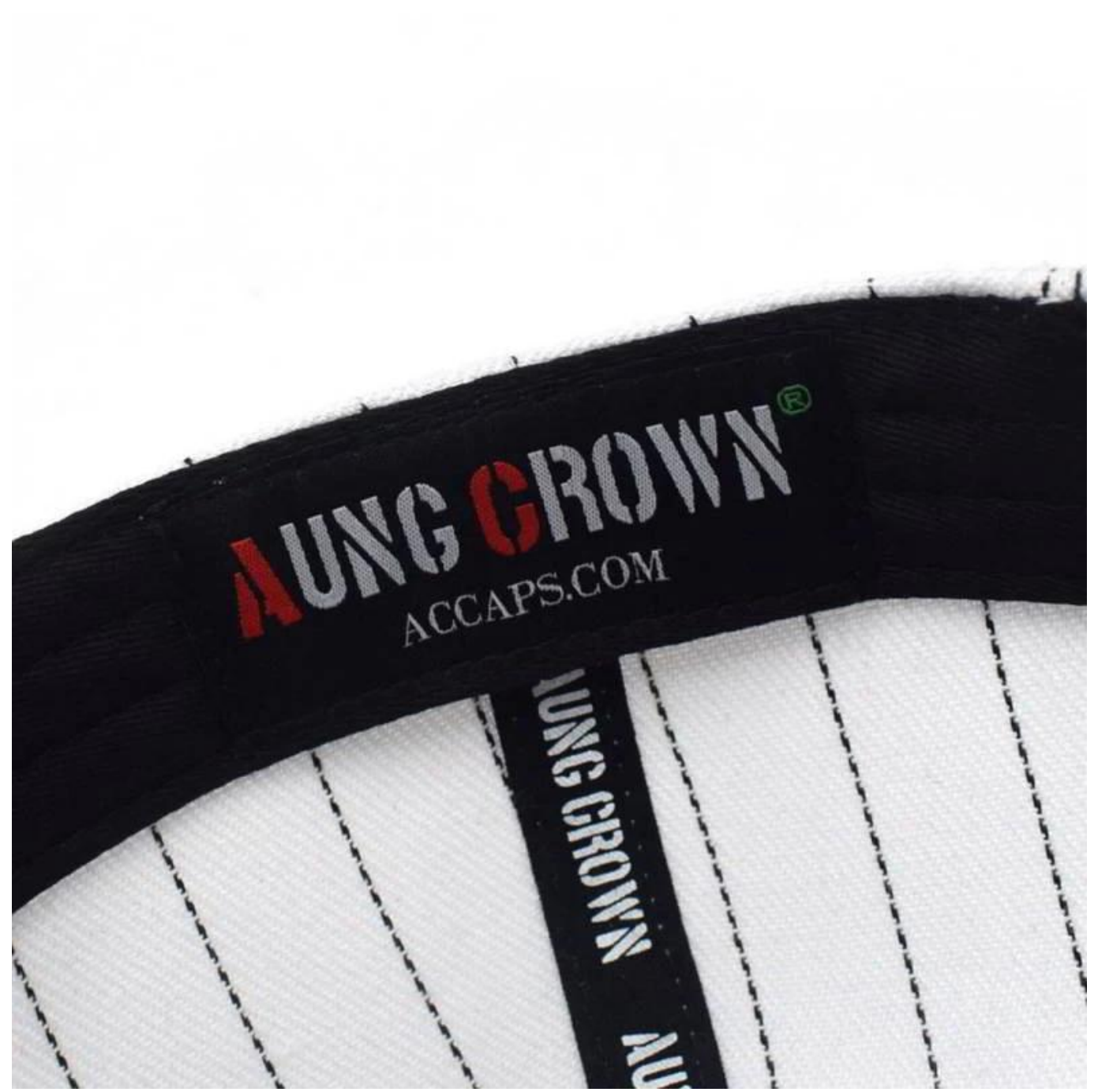
If you like below hats, please tell the item number to the salesman>>>