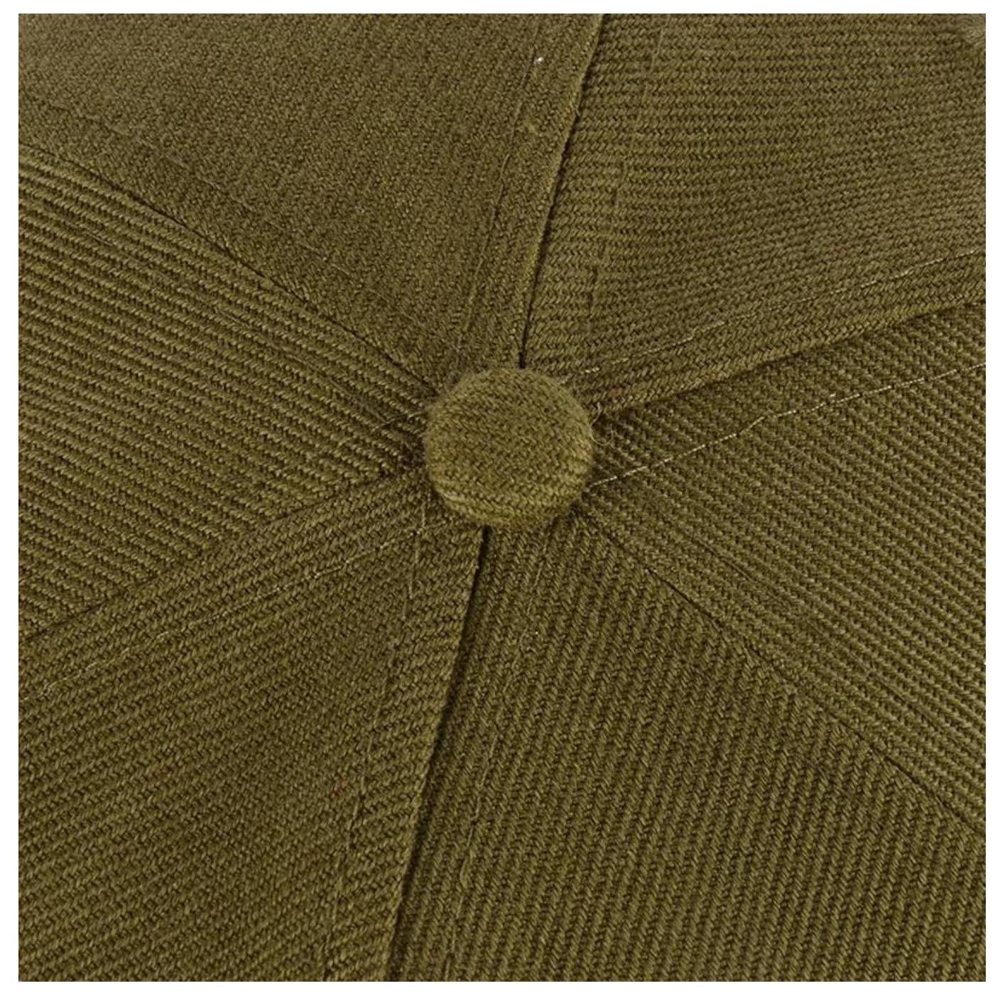
More pictures and discount, please CLICK HERE>>>