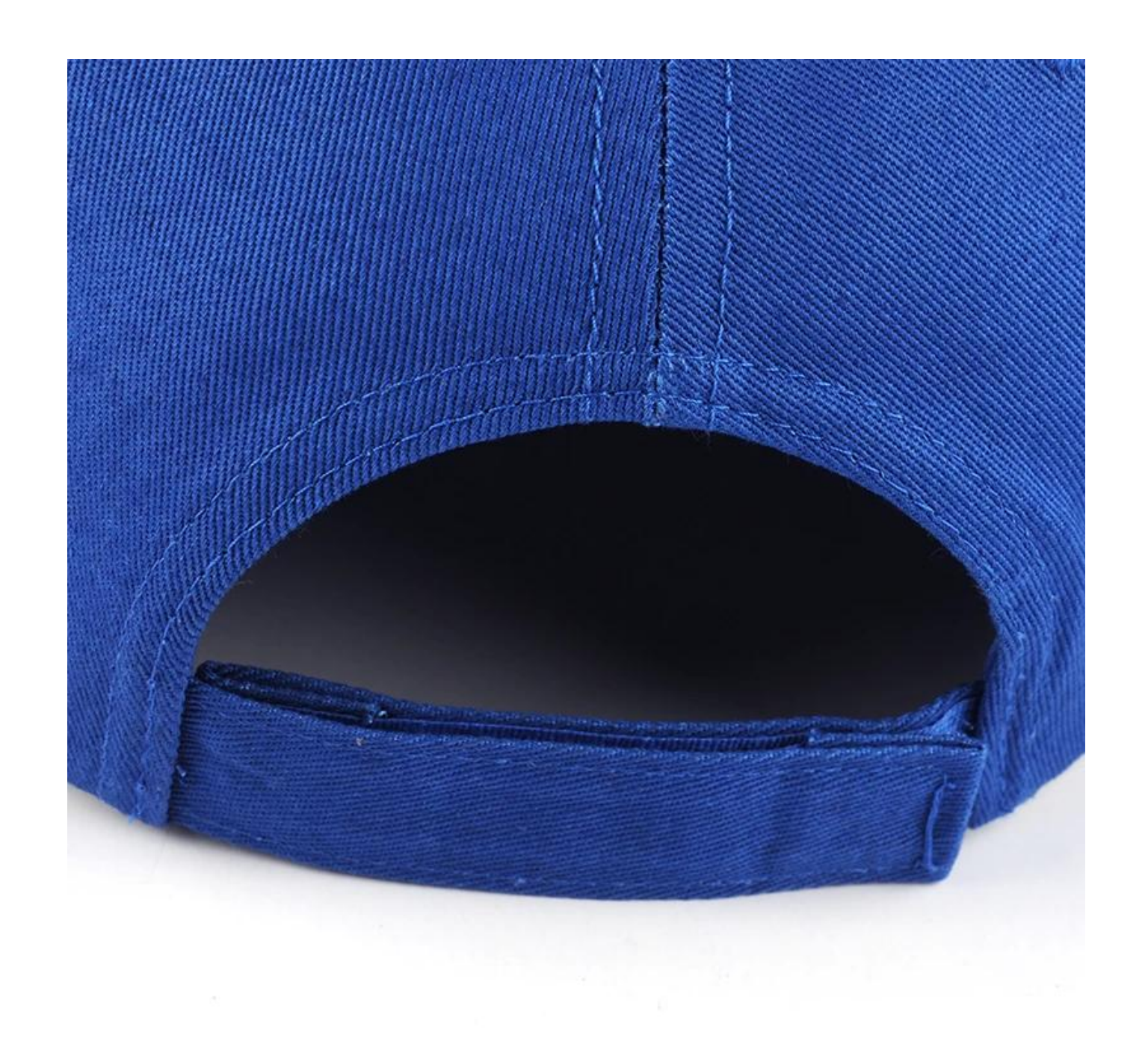
promotional 5 panels baseball caps, High Quality 5 panels baseball caps, 5 panels baseball caps \,