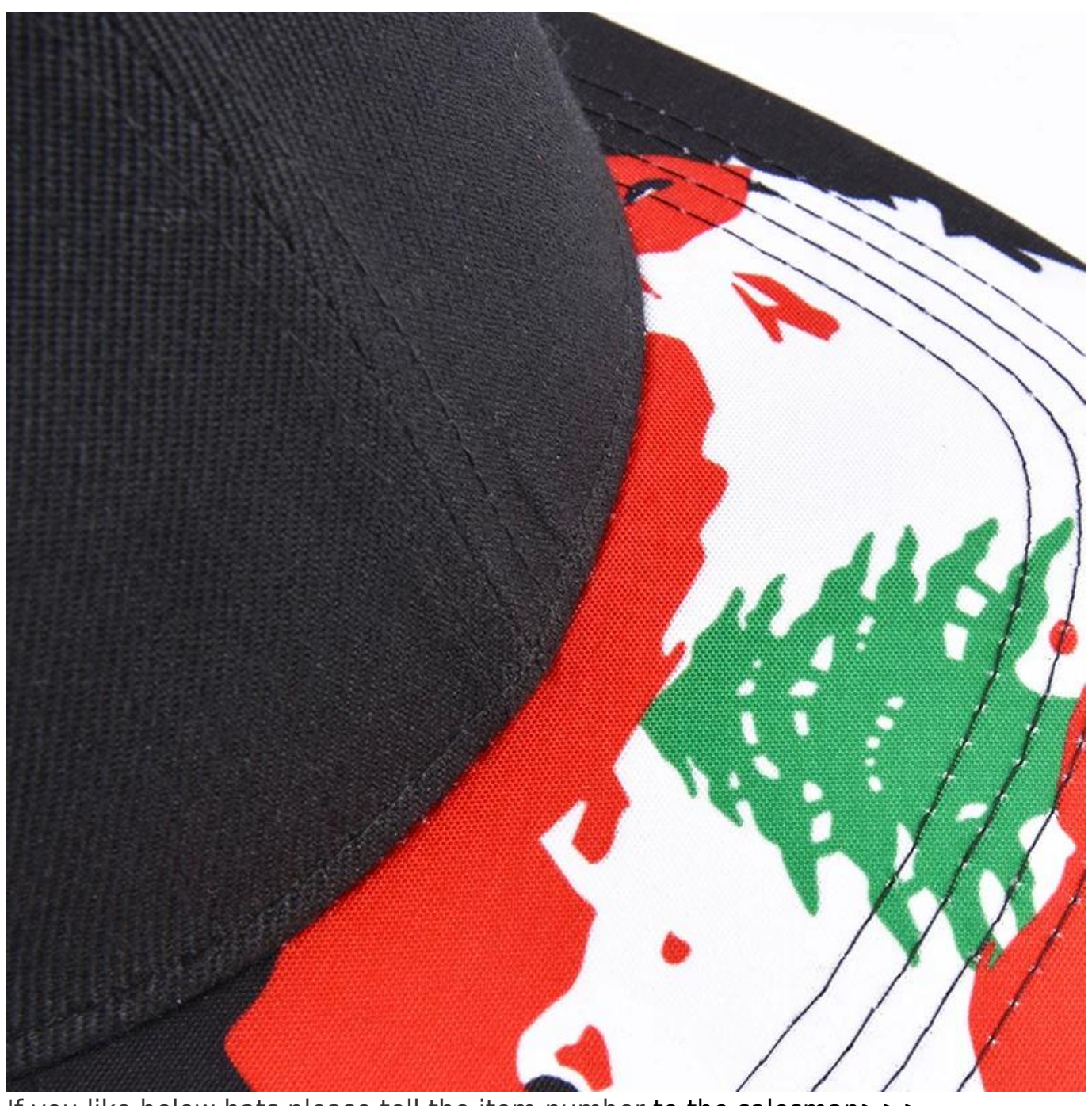
If you like below hats, please tell the item number to the salesman>>>