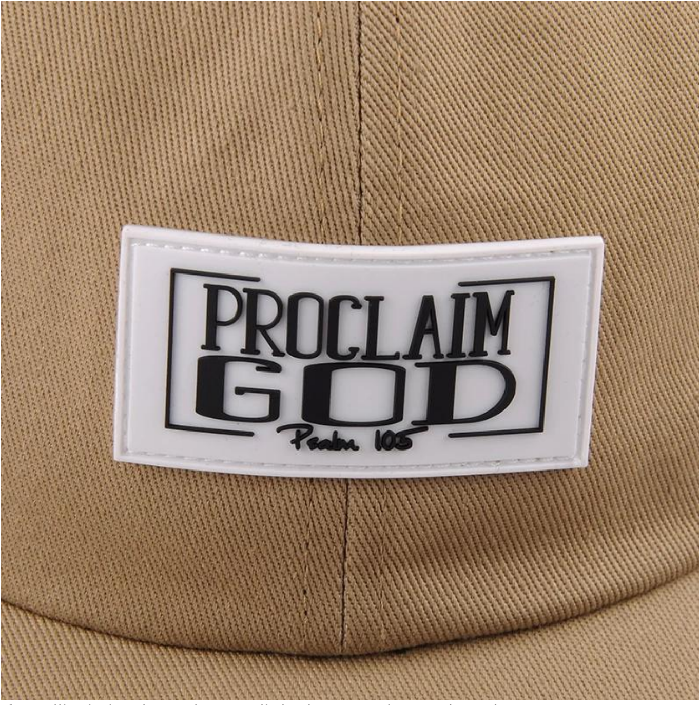
If you like below hats, please tell the item number to the salesman>>>