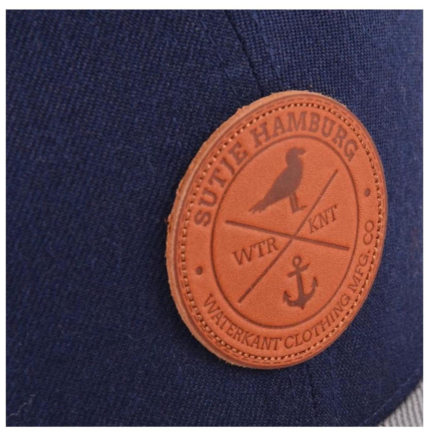
More pictures and discount, please CLICK HERE>>>