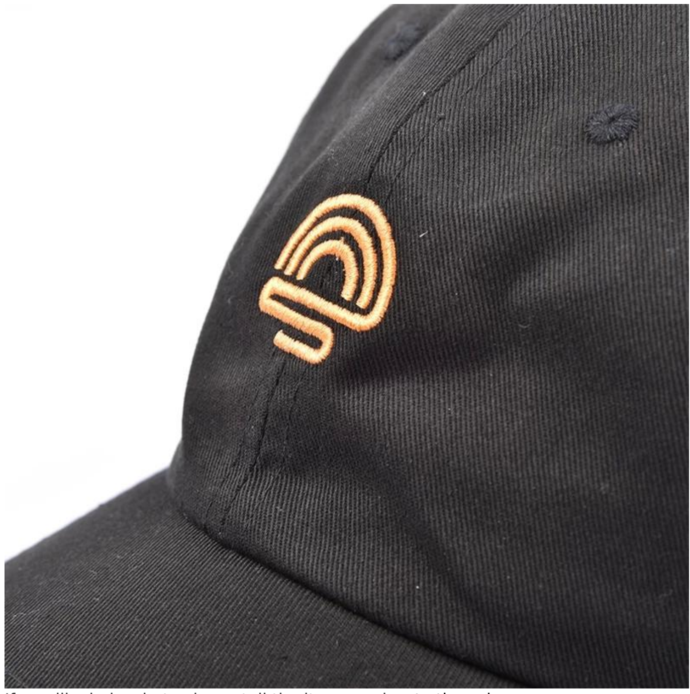
If you like below hats, please tell the item number to the salesman>>>