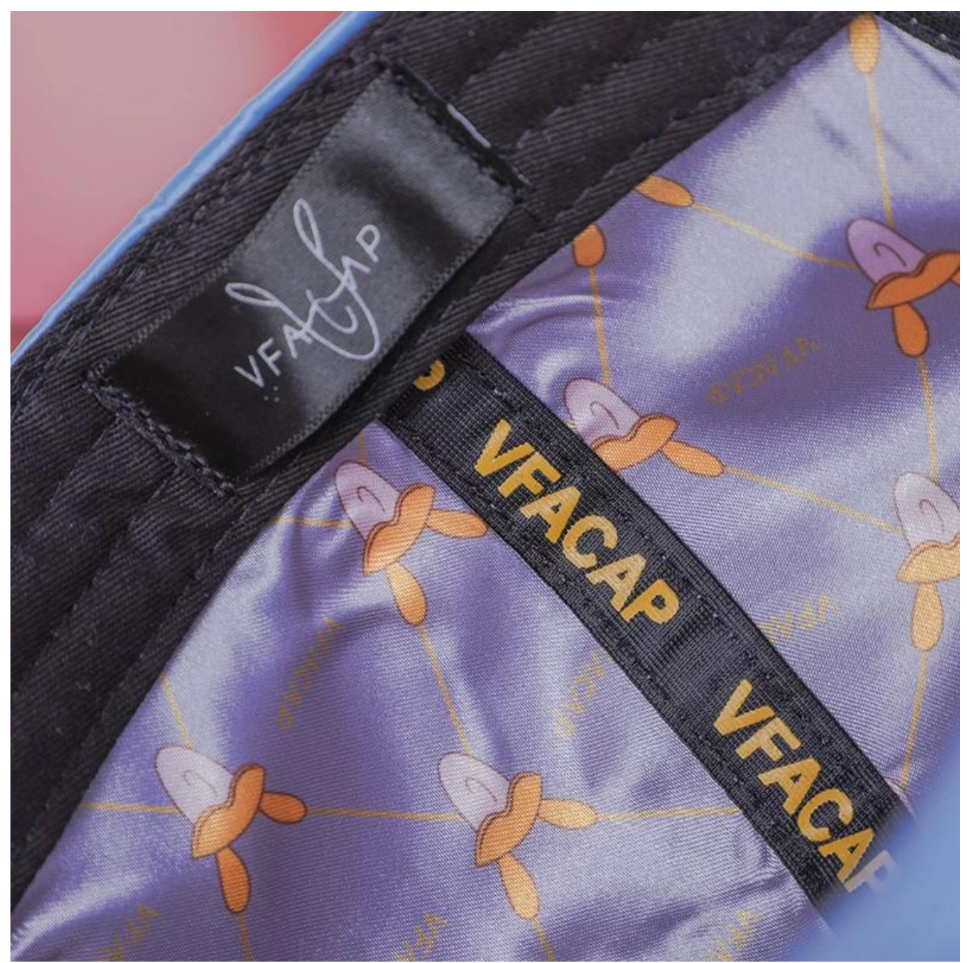
If you like below hats, please tell the item number to the salesman>>>