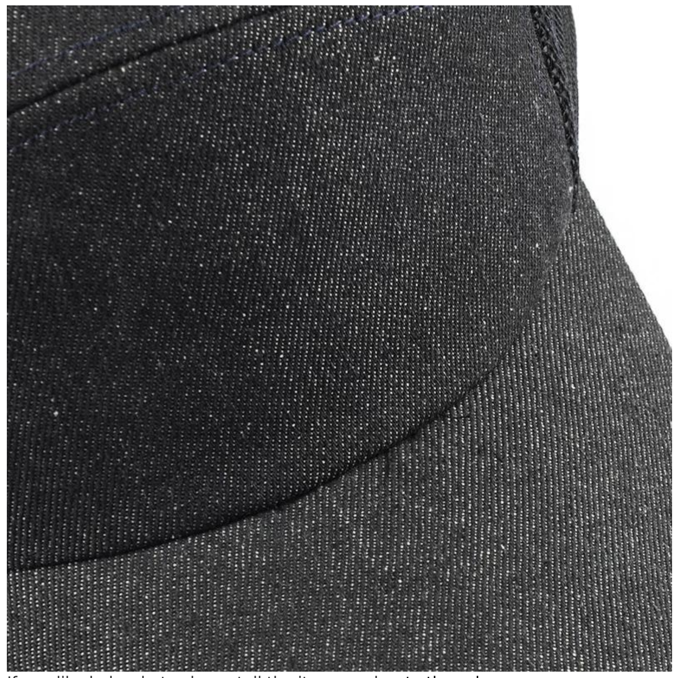
If you like below hats, please tell the item number to the salesman>>>