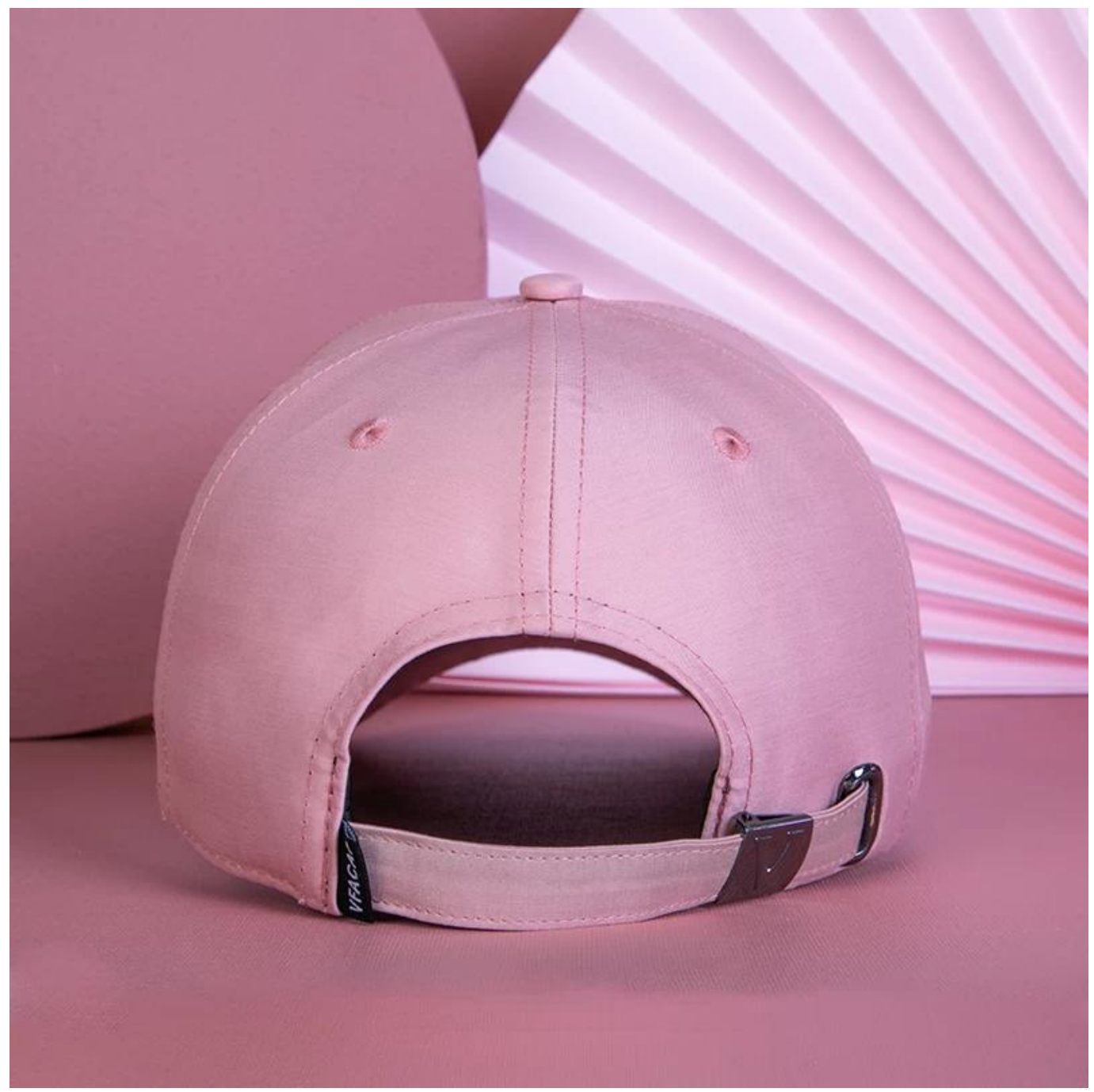
If you like below hats, please tell the item number to the salesman>>>