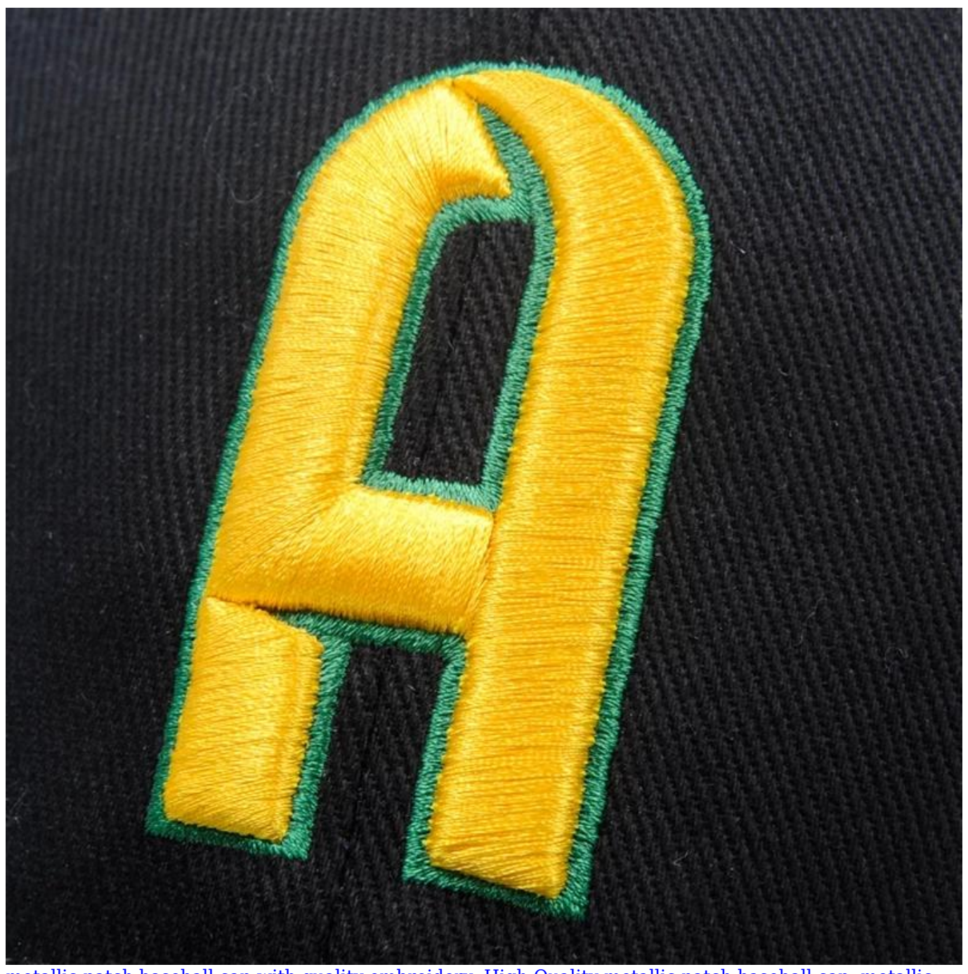
metallic patch baseball cap with quality embroidery, High Quality metallic patch baseball cap, metallic patch baseball cap other baseball caps you may like: