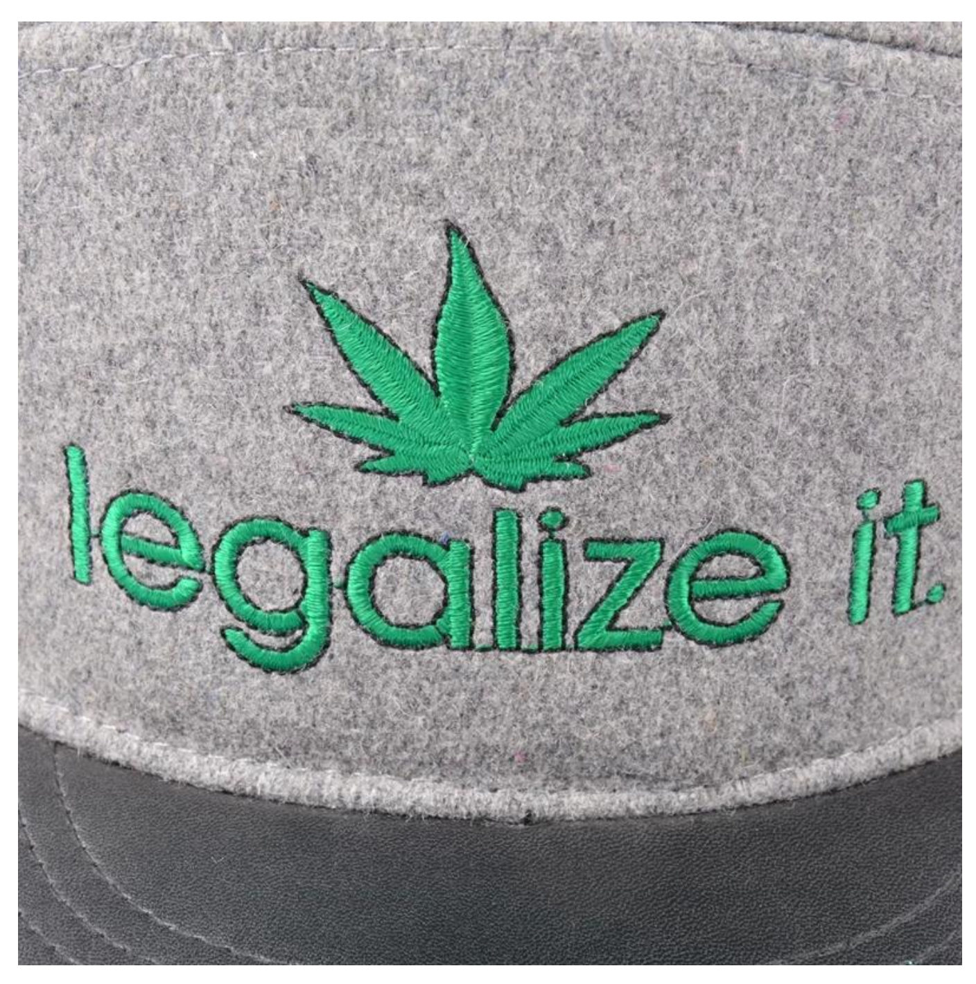
More pictures and discount, please CLICK HERE>>>