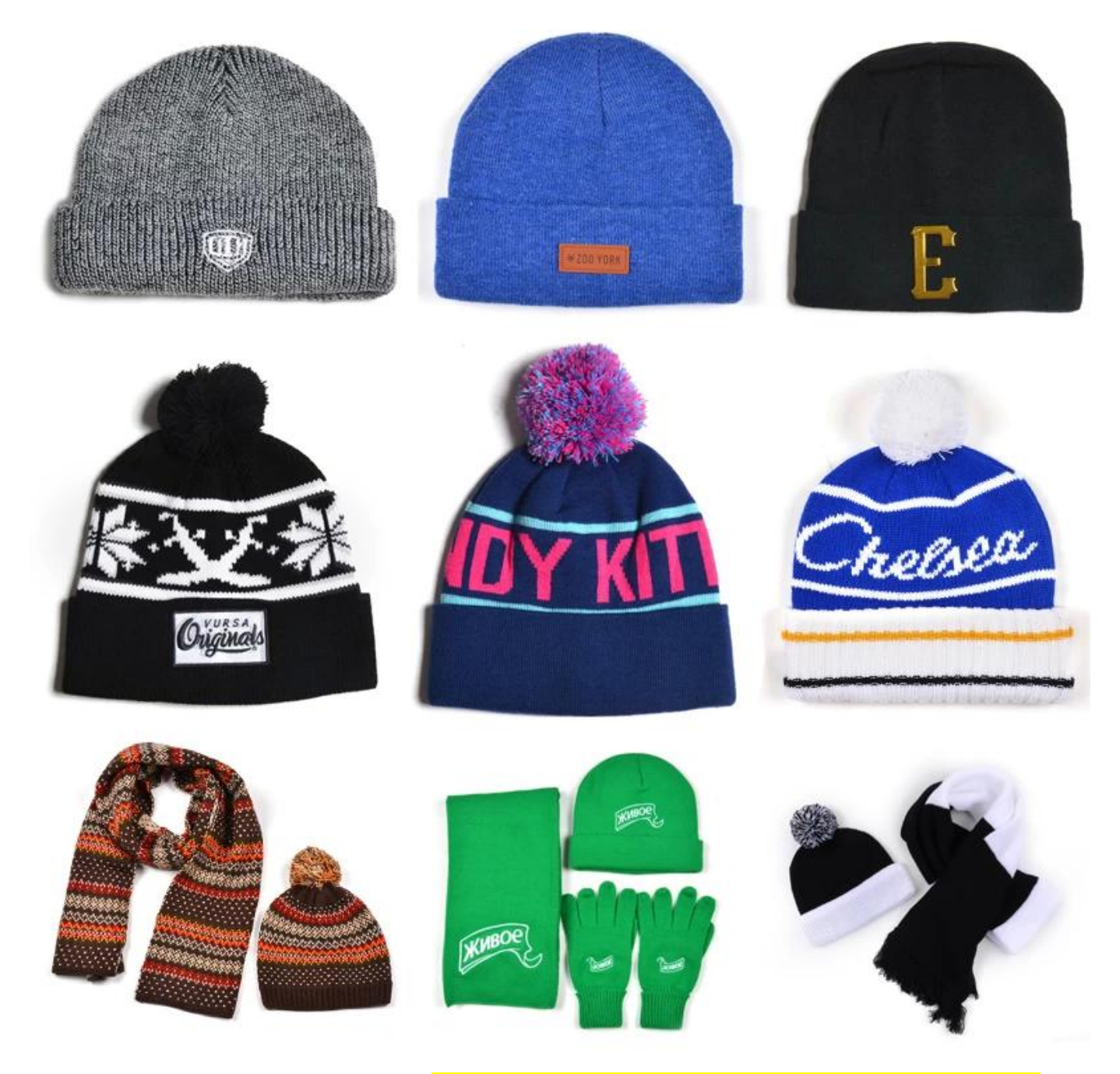
Exquisitely contoured hat(knitted beanie hat patterns for adults)