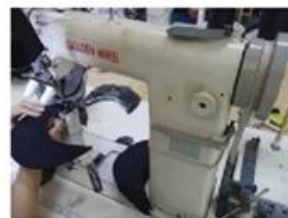
Special Streamlined Lockstitch Machine