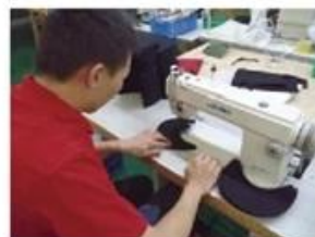
Edge Trimming Machine