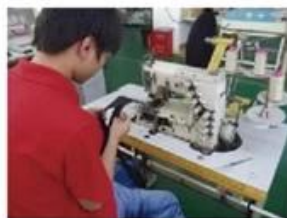
Sweatband Processing Machine