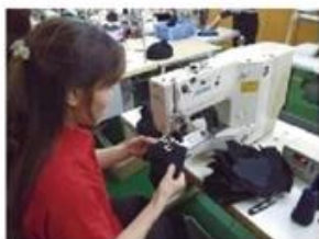
Eyelet Embroidering Machine