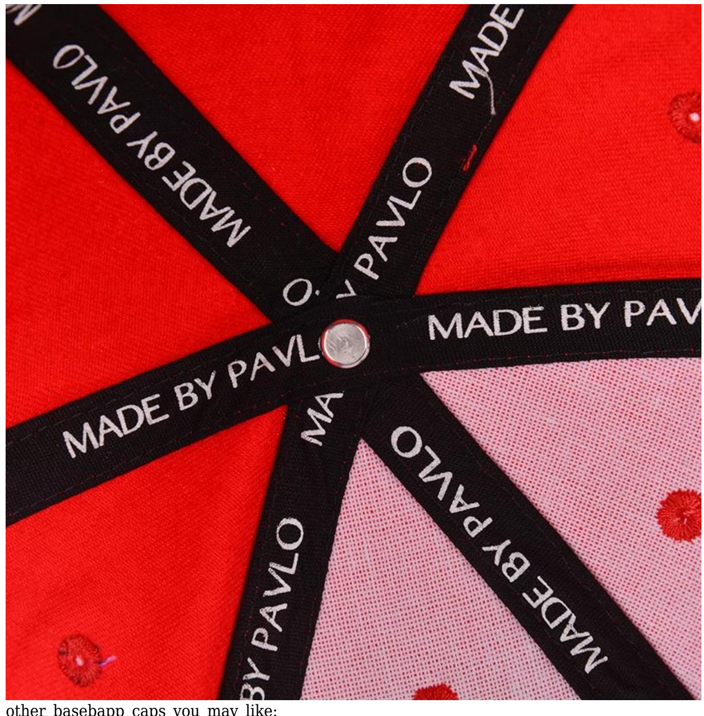
other basebapp caps you may like: