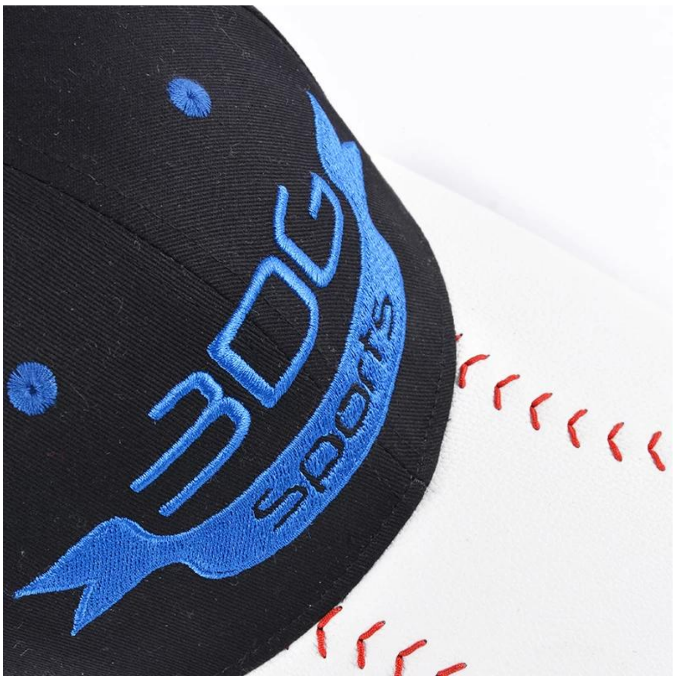
If you like below hats, please tell the item number to the salesman>>>