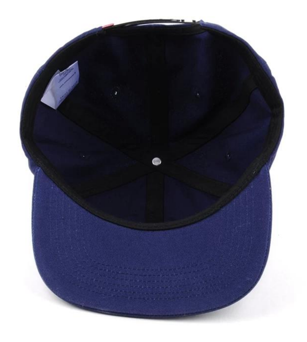
If you like below hats, please tell the item number to the salesman>>>