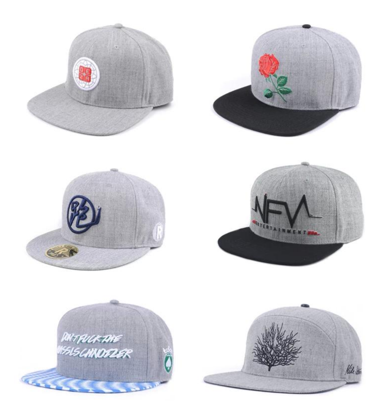
embroidery\ logo\ leather\ snapback\ hat,\ High\ Quality\ embroidery\ leather\ hat,\ embroidery\ leather\ hat