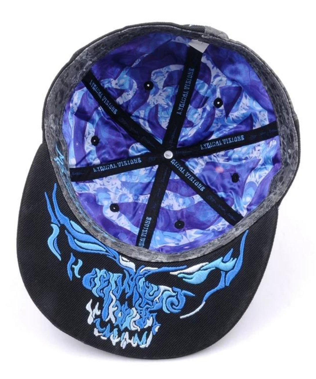
Other flexfit snapback hats custom design you may like: