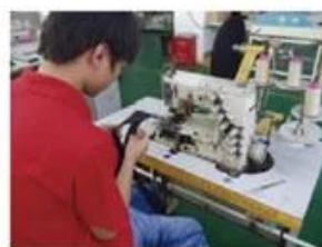
Sweatband Processing Machine