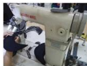
Special Streamlined Lockstitch Machine