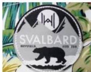
WOVEN KABEK PATCH/ PRINT LABEL PATCH