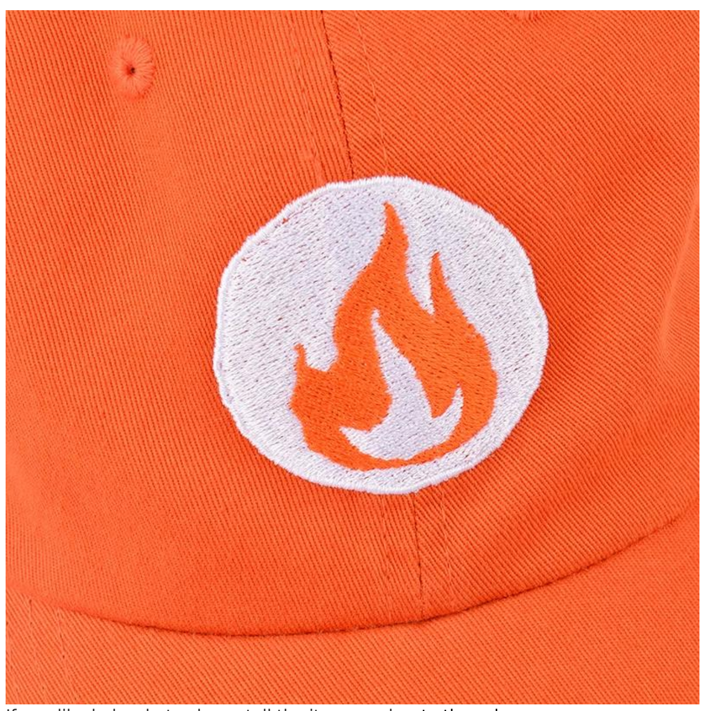
If you like below hats, please tell the item number to the salesman>>>