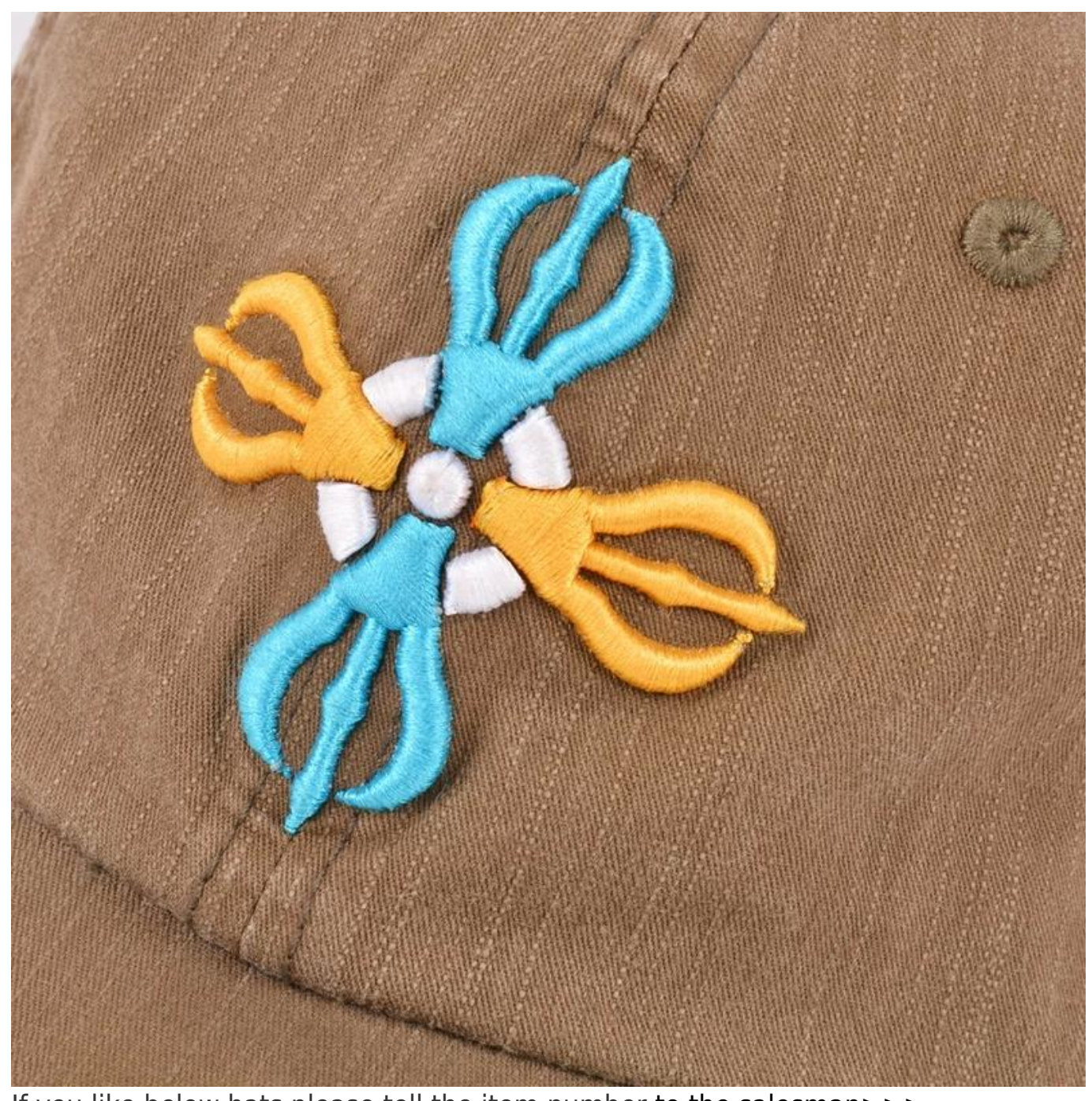
If you like below hats, please tell the item number to the salesman>>>