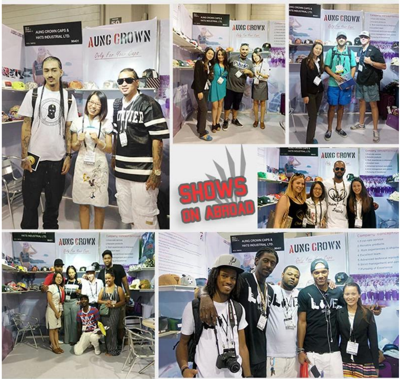
knitted winter hat manufacturer china,custom winter hats with logo, custom embroidered snap