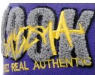
APPLIQUE WITH TOWEL