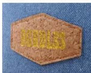
PRINT CORK PATCH