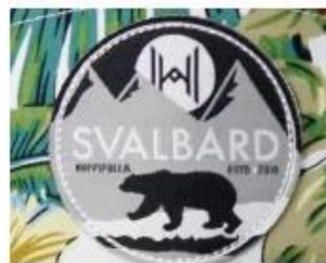
WOVEN KABEK PATCH/ PRINT LABEL PATCH