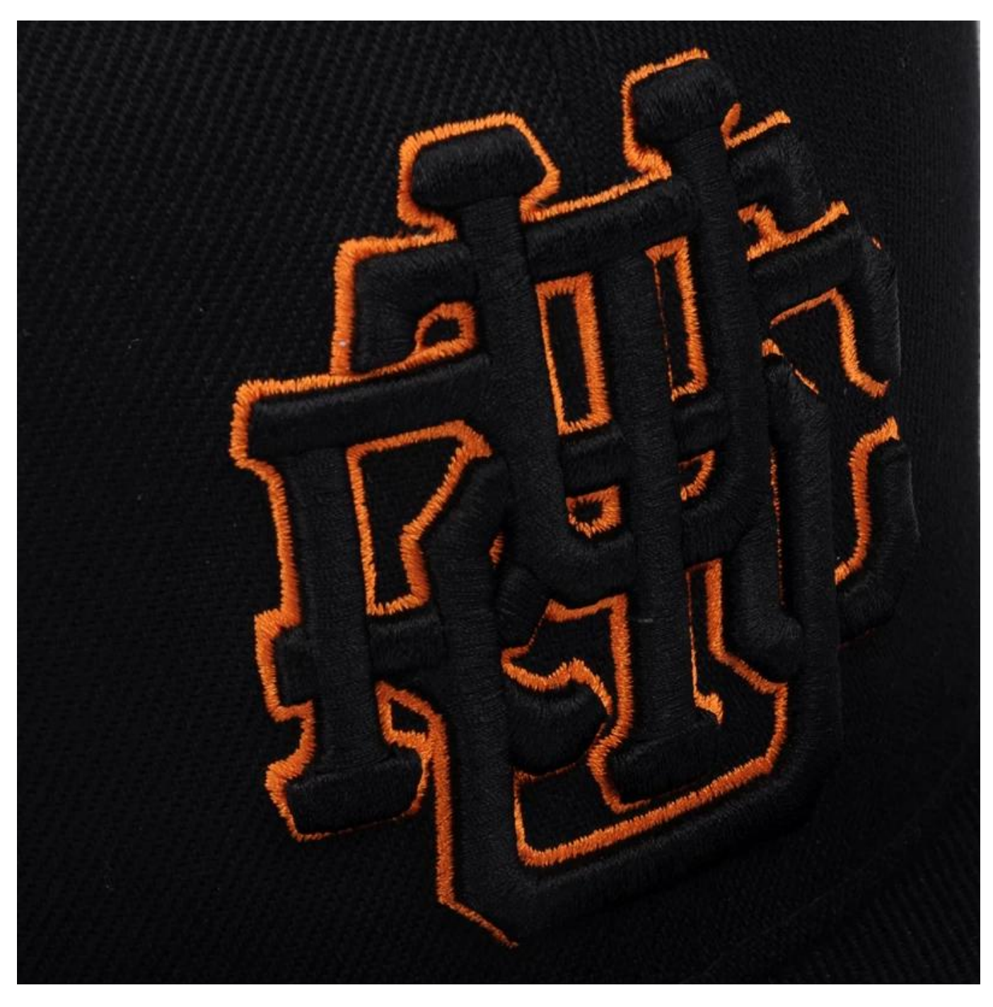
Other snapback cap(black snapback caps supplier china) models you may like