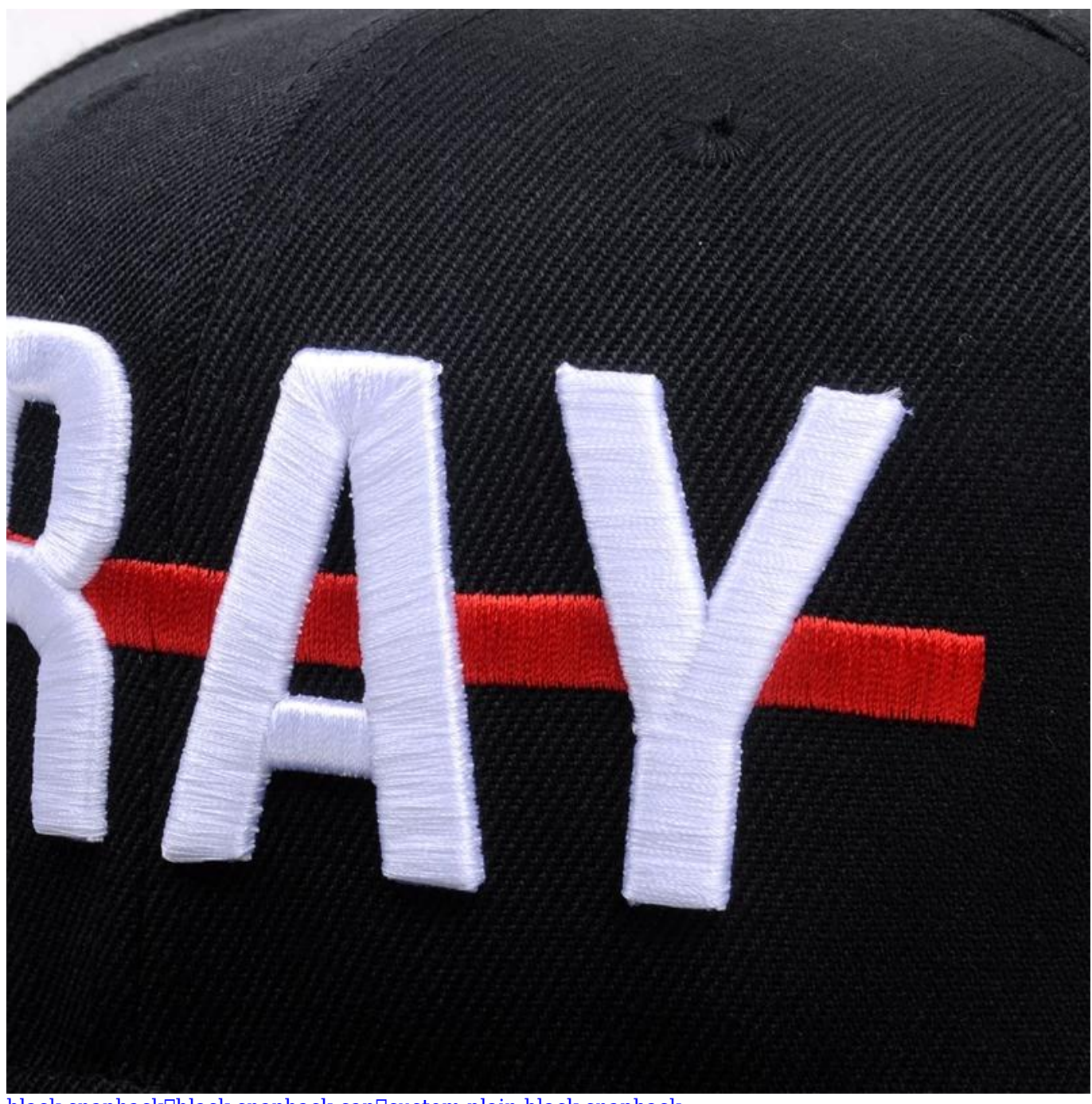
black snapback plack snapback cappcustom plain black snapback other snapback caps you may like: