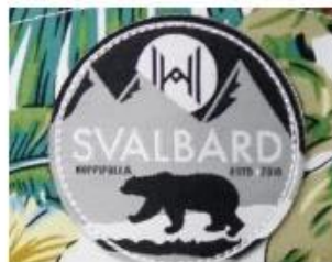
WOVEN KABEK PATCH/ PRINT LABEL PATCH