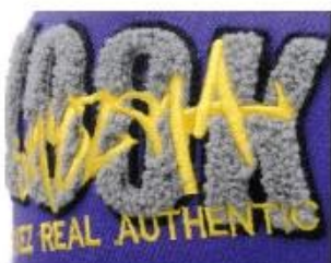
APPLIQUE WITH TOWEL