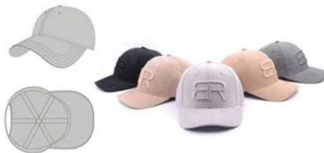
SHOWN STRUCTURED 6 PANEL FLAT BILL 100% POLYESTER 3D EMBROIDERED