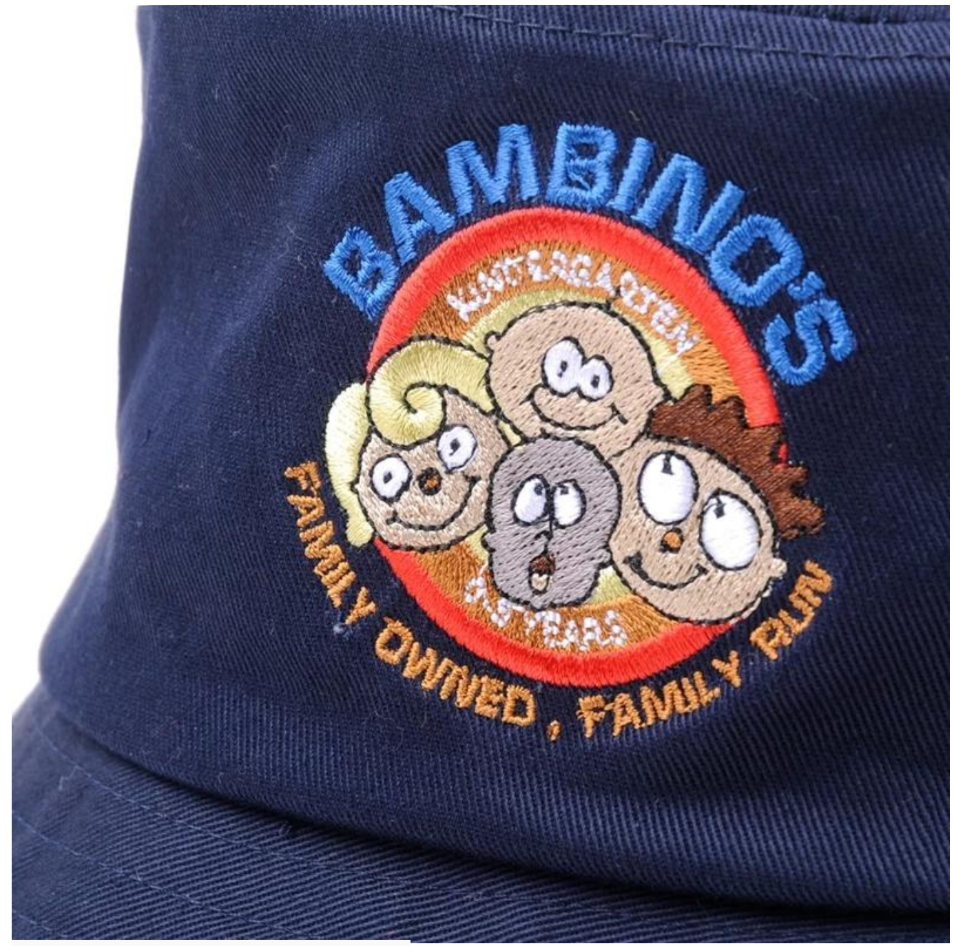
other baby hats maybe you like it