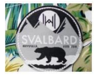
WOVEN KABEK PATCH/ PRINT LABEL PATCH