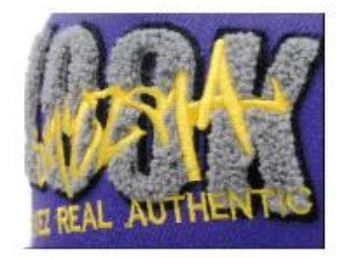
APPLIQUE WITH TOWEL