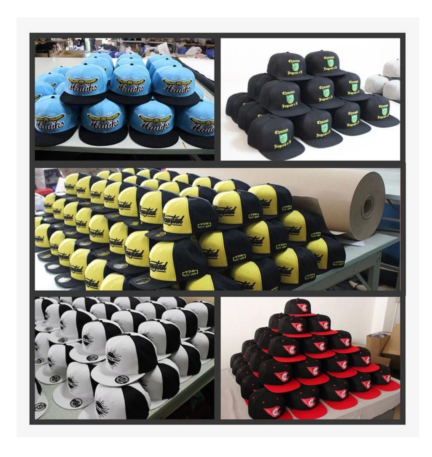
If you want to know more or have any questions feel free to contact us