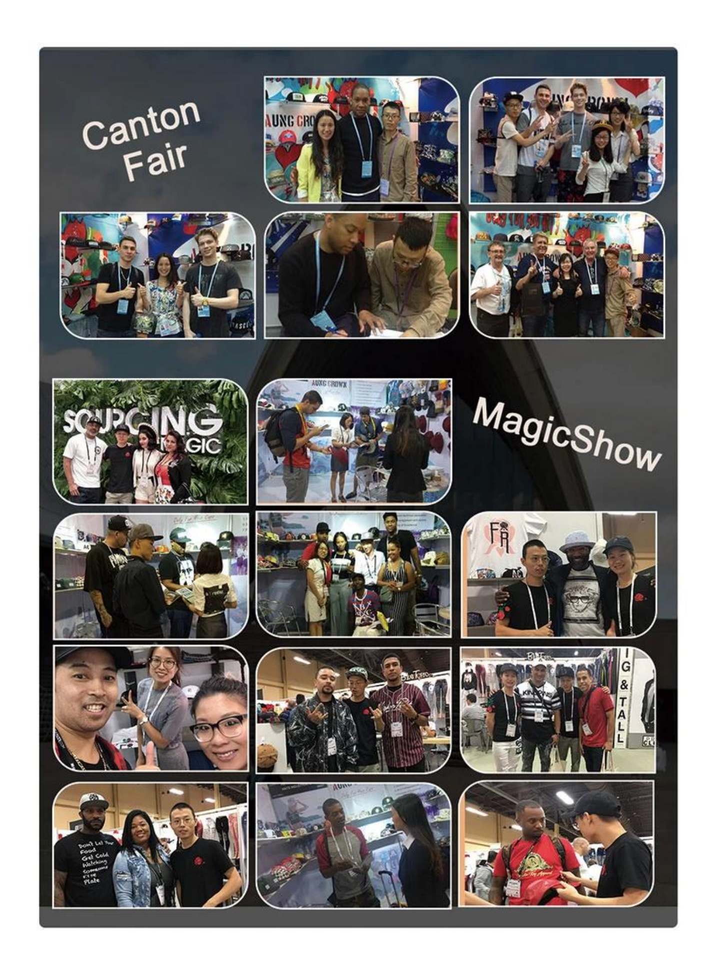
As one of the old hat brands, Aungcrown has always conveyed a tenacious and tenacious spirit. The