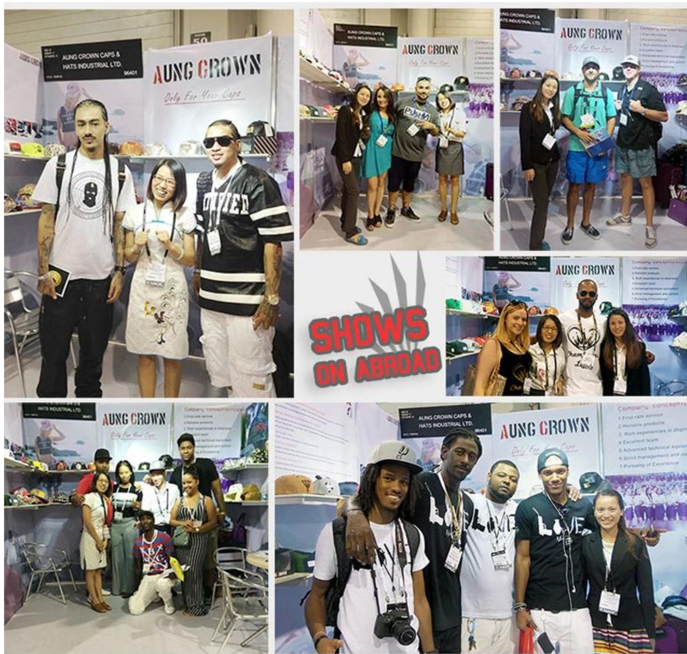
baseball cap with logo , custom embroidery snapback hats , 3d embroidery hats custom