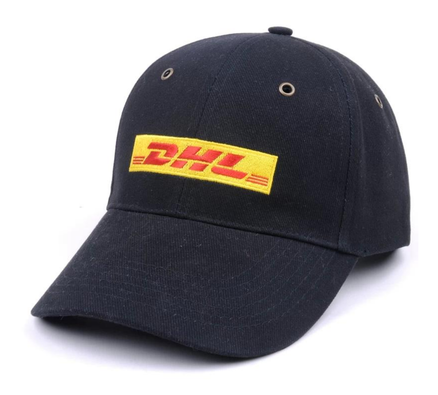
hot-sale\ products [ \cite{Cap Factory China}