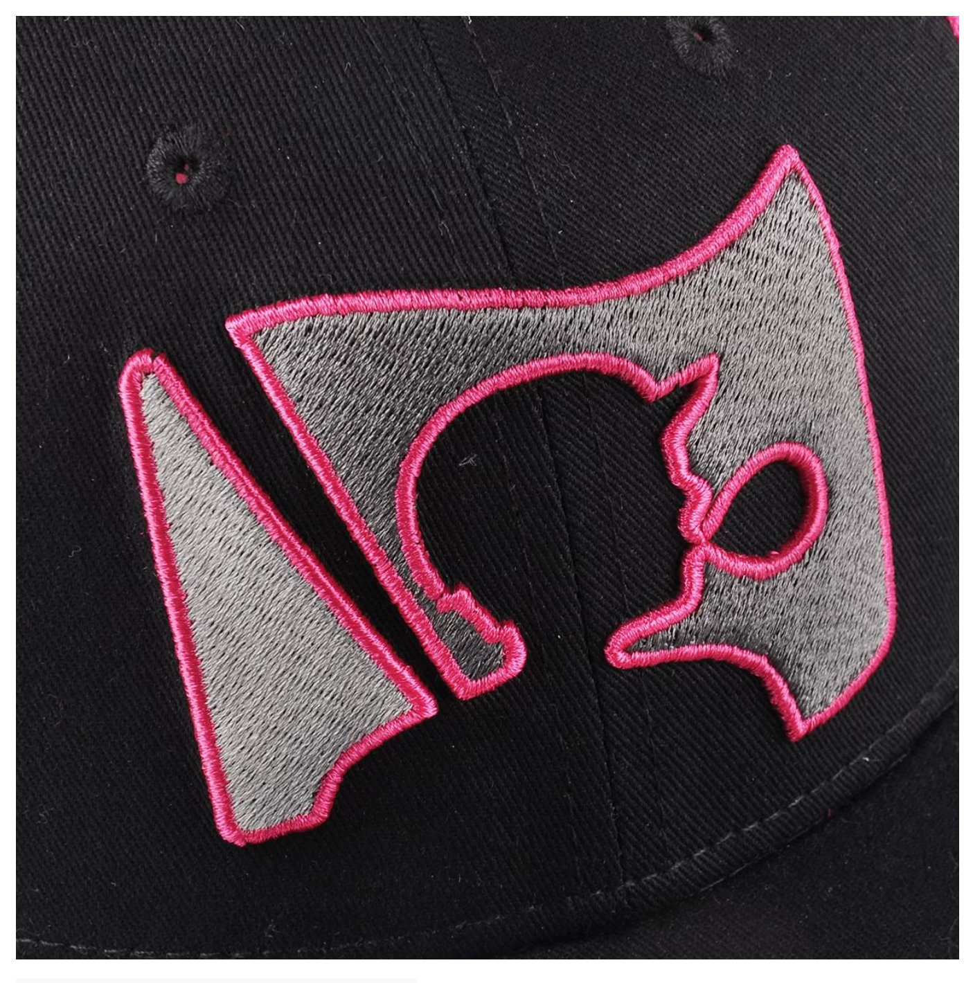
other baby hats maybe you like it