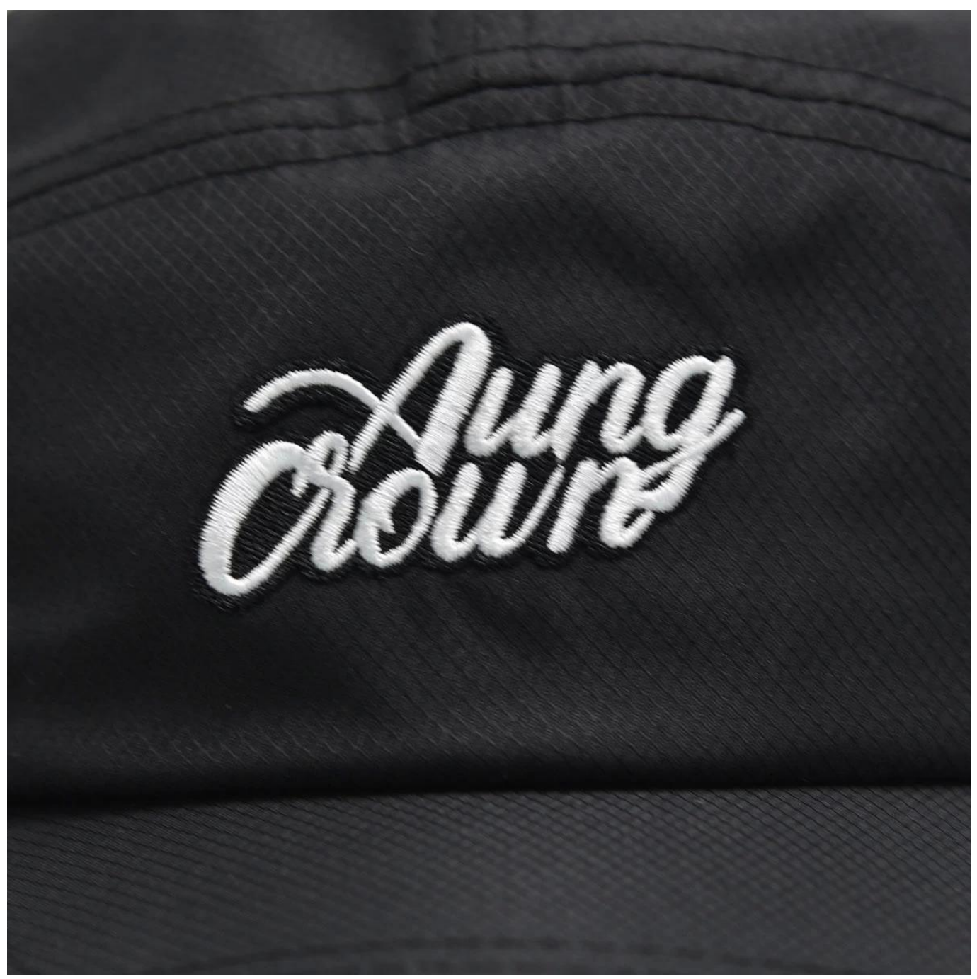
If you like below hats, please tell the item number to the salesman>>>