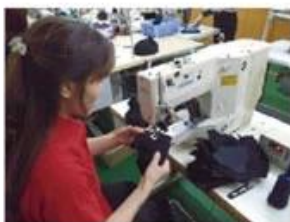
Eyelet Embroidering Machine