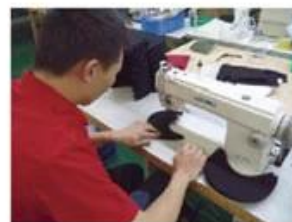
Edge Trimming Machine