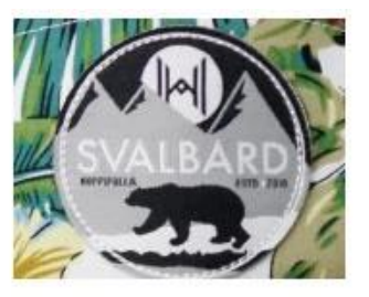
WOVEN KABEK PATCH/ PRINT LABEL PATCH