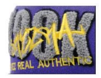
APPLIQUE WITH TOWEL