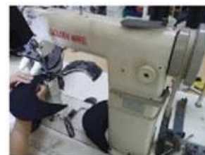
Special Streamlined Lockstitch Machine