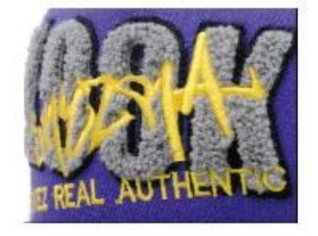
APPLIQUE WITH TOWEL