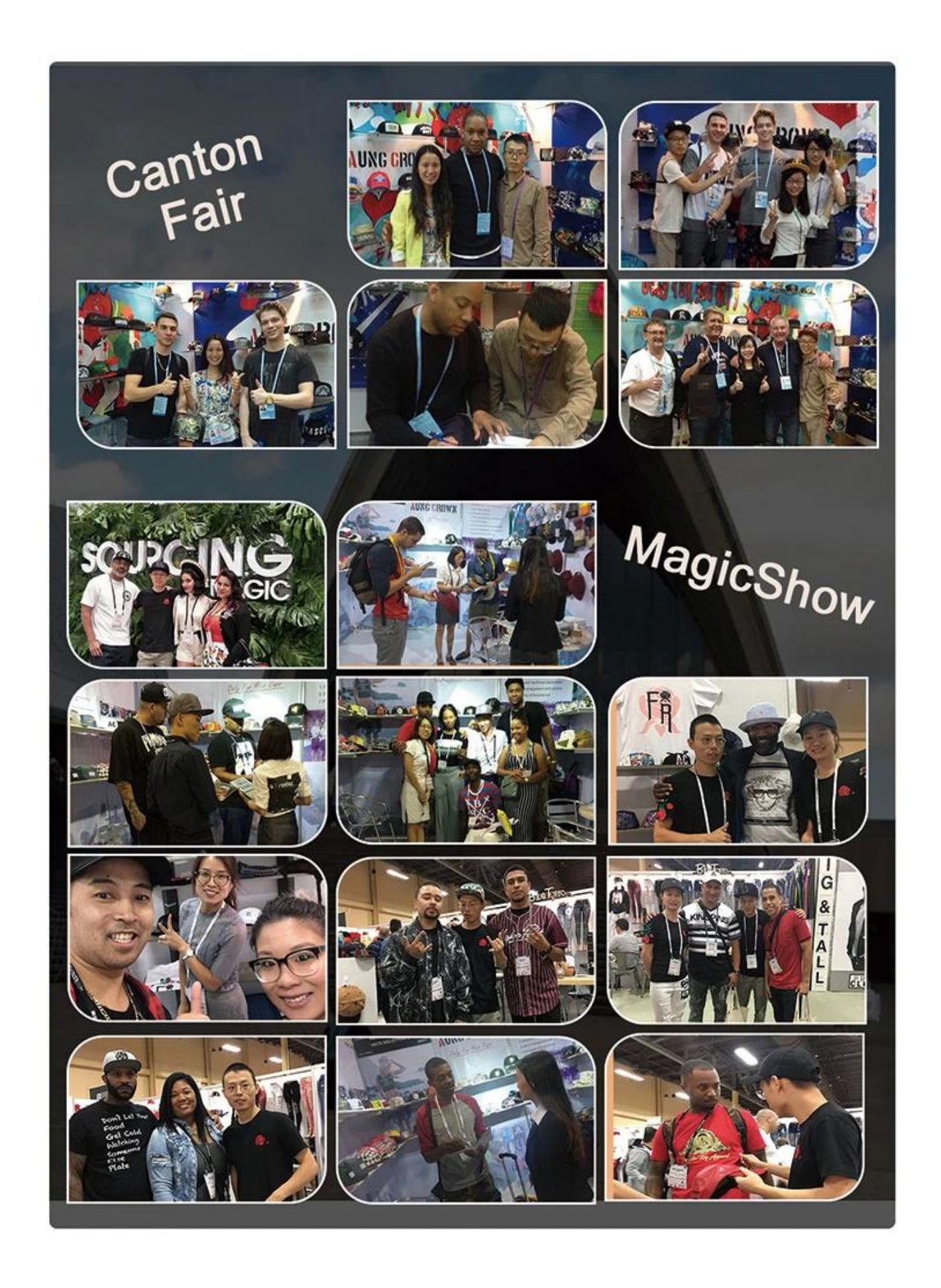
As one of the old hat brands, Aungcrown has always conveyed a tenacious and tenacious spirit. The \,