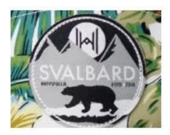
WOVEN KABEK PATCH/ PRINT LABEL PATCH