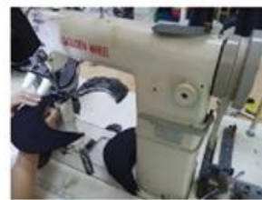
Special Streamlined Lockstitch Machine