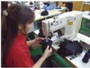
Eyelet Embroidering Machine