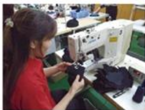
Eyelet Embroidering Machine