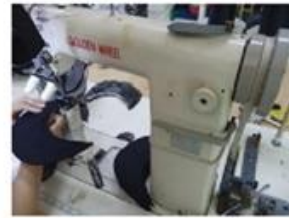
Special Streamlined Lockstitch Machine