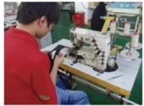
Sweatband Processing Machine