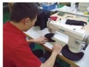
Edge Trimming Machine