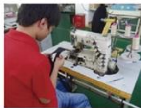
Sweatband Processing Machine