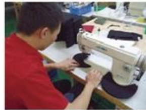
Edge Trimming Machine