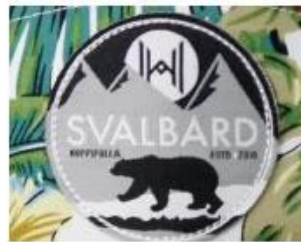
WOVEN KABEK PATCH/ PRINT LABEL PATCH