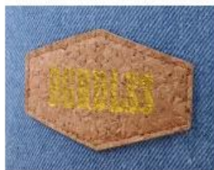
PRINT CORK PATCH