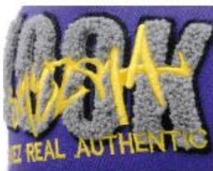
APPLIQUE WITH TOWEL