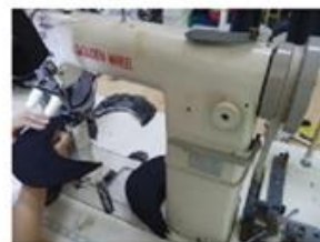
Special Streamlined Lockstitch Machine