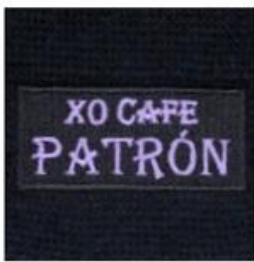
EMBROIDERED PATCH 100% EMBROIDERED PATCH | MERROWED EDGE