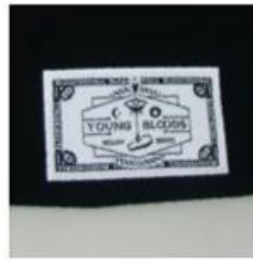
WOVEN LABEL HIGH LEVEL OF DETAIL | SEWN DIRECTLY TO FABRIC