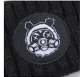
WOVEN LABEL & MERROWED EDGE HIGH DETAIL | RAISED MERROWED EDGING